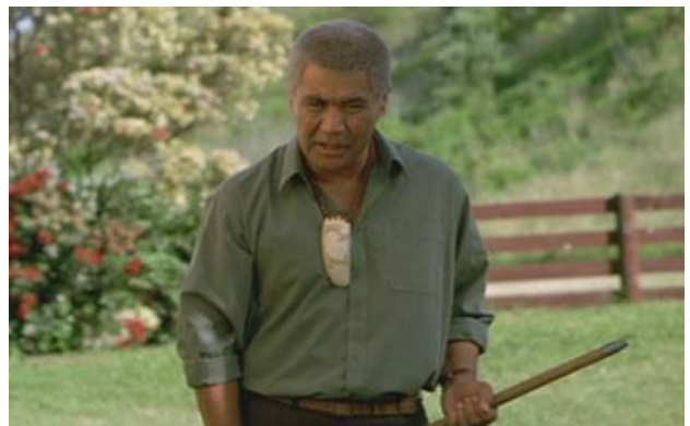
Koro - Pai's grandfather/the tribal chief