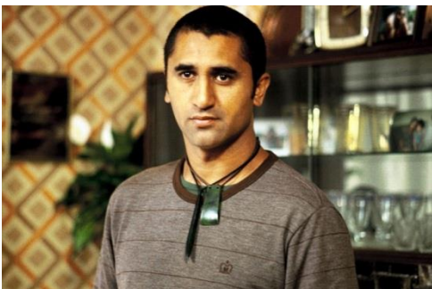
Porourangi - Pai's father