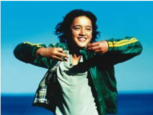
Pai (Paieka) - protagonist