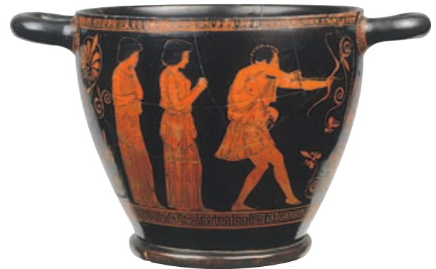
About 450–440 B.C.: Clay urn showing Odysseus slaying Penelope's suitors