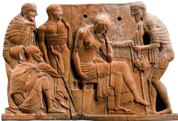
About 460–450 B.C.: Terra cotta plaque showing the return of Odysseus