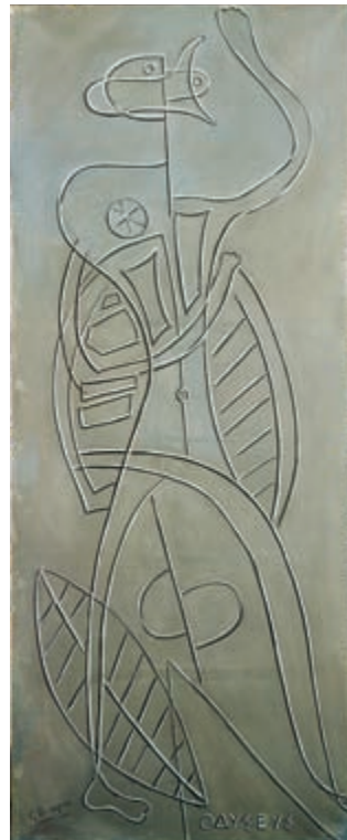
1931–1932: Ulysses , Georges Braque. Pastel drawing.

Narrative Art Most of the artwork in this selection tells a story in one way or another. Consider how the artist's choices of what to include and emphasize affect your sense of the events portrayed in each work. Compare and contrast how these events are presented in visual form with how they are presented in the text.