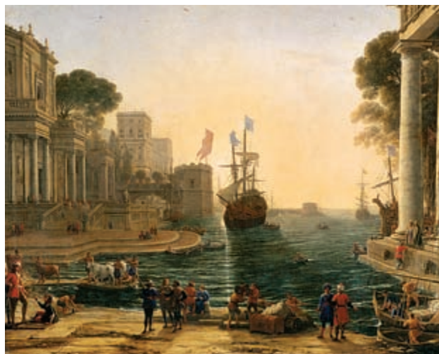
About 1650: Ulysses Returns Chryseis to Her Father , Claude Lorraine. Oil painting.