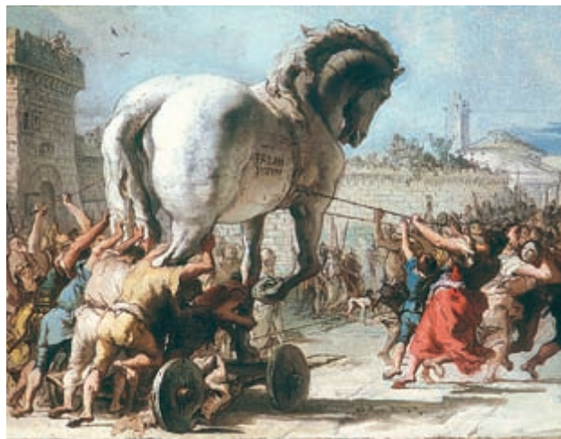
Giovanni Domenico Tiepolo's The Procession of the Trojan Horse into Troy , painted in 1773

After Hector's death, the Greeks brought the war to an end thanks to the cleverness of Odysseus, ruler of the island of Ithaca. To break the ten-year stalemate, Odysseus thought of a scheme to make the Trojans think that the Greeks had finally given up. He ordered a giant wooden horse to be built and left at the gates of Troy. The Trojans, waking to find it there—without a Greek in sight—assumed that the enemy had fled and left them a peace offering. They took the horse inside the city, only to discover, too late, that it was filled with Greek soldiers and that Troy was doomed.