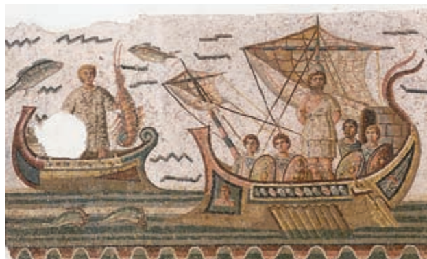
200s: Ulysses and the Sirens, Roman. Mosaic, 130 cm x 344 cm. Musée du Bardo, Tunis, Tunisia.