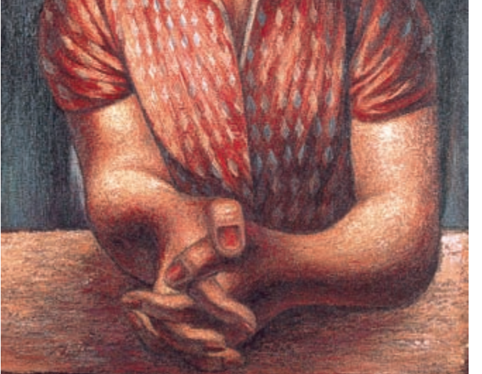
Woman Worker (1951), Charles White.

<sup>60</sup> My mother finally went to work as a cook and left me and my brother alone in the flat each day with a loaf of bread and a pot of tea. When she returned at evening she would be tired and <u>dispirited</u> and would cry a lot. Sometimes, when she was in despair, she would call us to her and talk to us for hours, telling us that we now had no father, that our lives would be different from those of other children, that we must learn as soon as possible to take care of ourselves, to dress ourselves, to prepare our own food; that we must take upon ourselves the responsibility of the flat while she worked. Half frightened, we