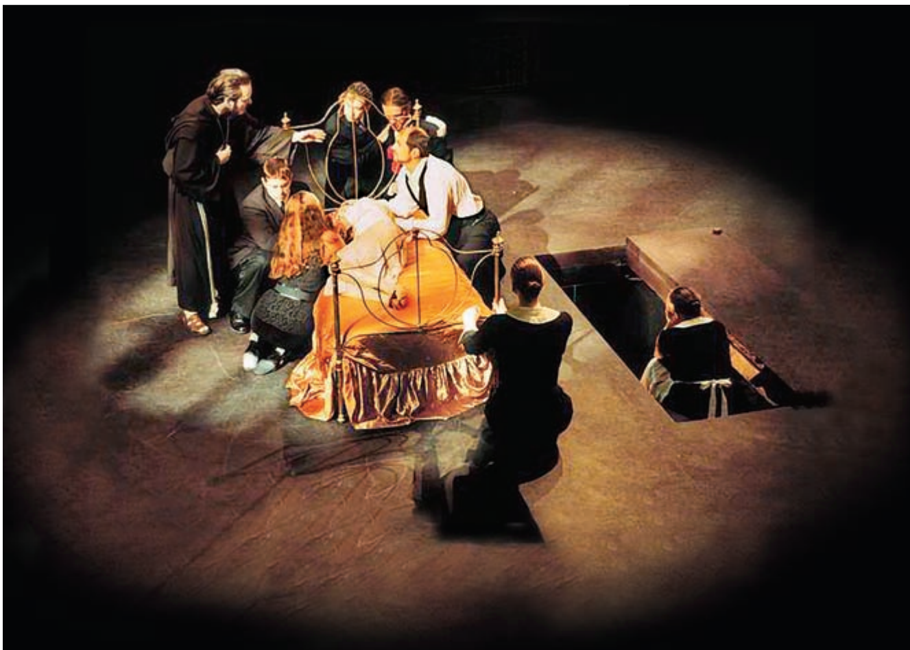
Friar Laurence and the Capulets mourn for Juliet in the University of Victoria's 1998 production.

Derivations Words formed from another word or base are derivations . The word lamentable (line 30) is derived from the base word lament , “to grieve.” What does lamentable mean? What other words are derived from this same word?